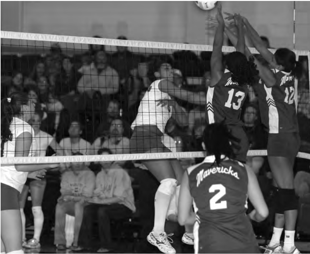
Mavericks in action.

NAU's women's volleyball team is undefeated with 24 wins and 0 losses, number 1 in Region III and number 2 in the United States, according to NAIA statistics, at the time of writing. Three other Region III teams (Dickinson State (N.D.), Dordt (Iowa) and Hastings (Neb.) are ranked in the top 25. The Mavericks are looking forward to another trip to the national tournament which will be held in San Diego, California, during November 30-December 3, 2005.