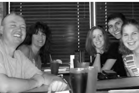
Out to lunch