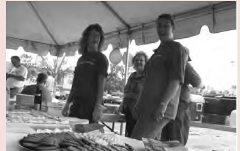
Student Appreciation Event at Roseville, Minn.