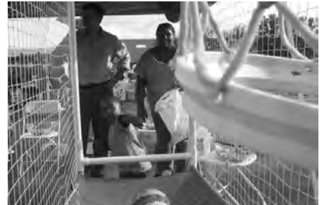
Student Appreciation Event at Roseville, Minn.